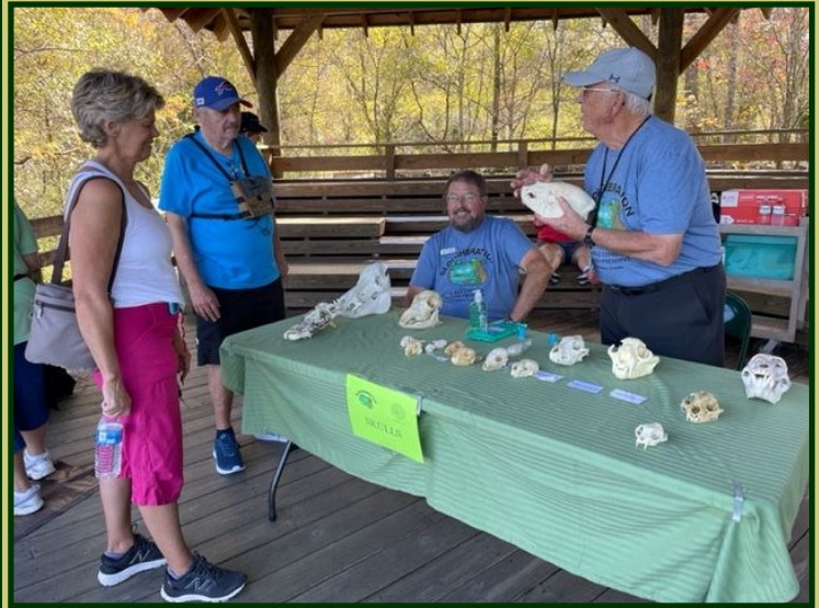
Skulls of the Slough