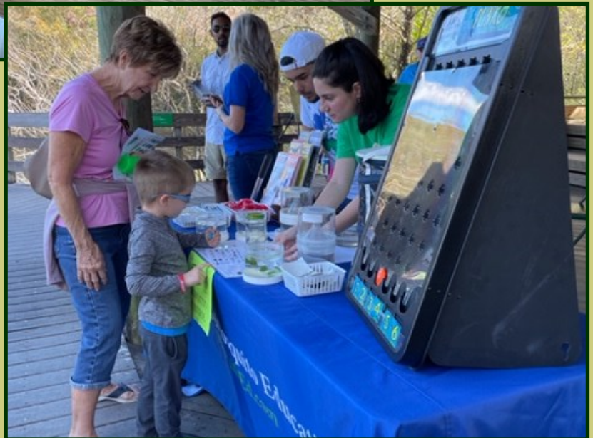
Lee County Mosquito Education