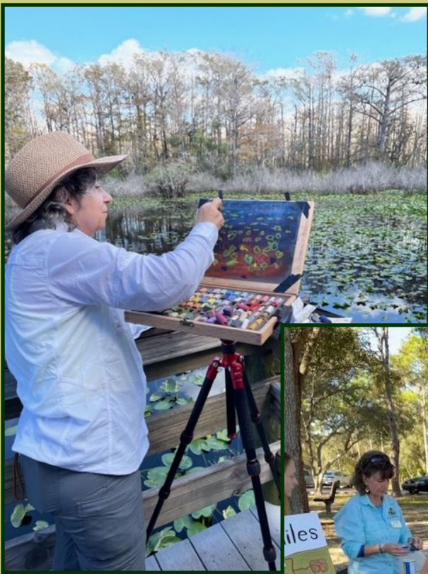
Artist at Otter Pond