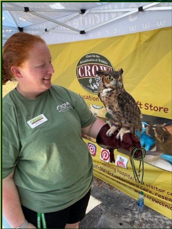
CROW's Great Horned Owl