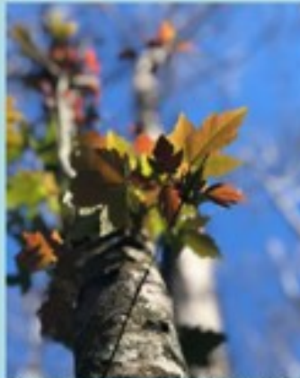
Sophia Grove (Youth Category)