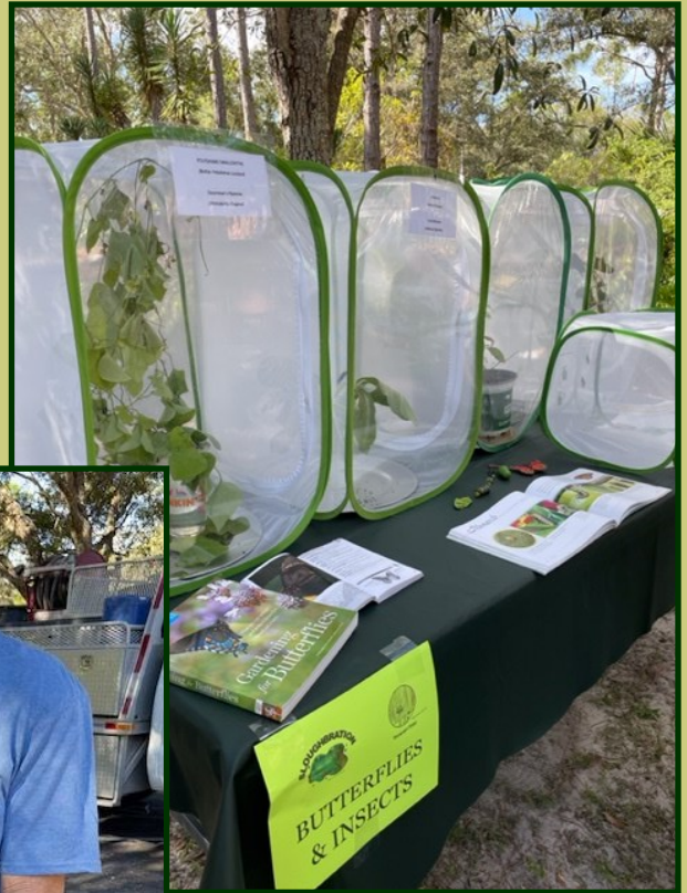
Butterfly Life Cycle