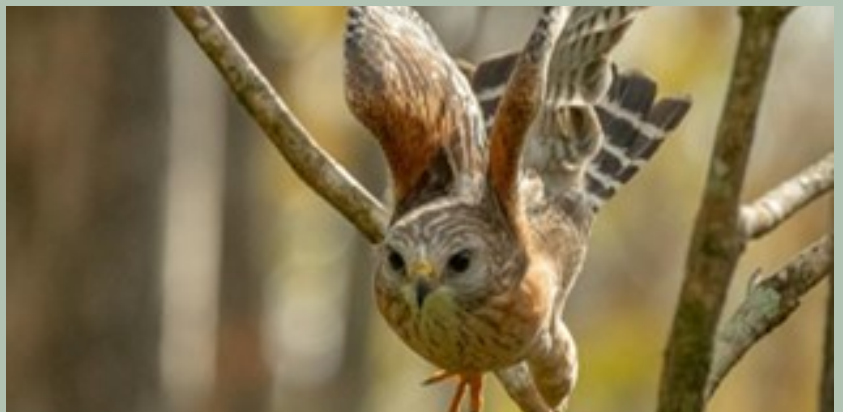
Red-shouldered hawk

Did you know that another term for a bird of prey is raptor? Raptor comes from the Latin word rapere, which means to seize or take by force.