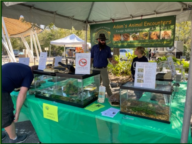
Adam's Animal Encounters