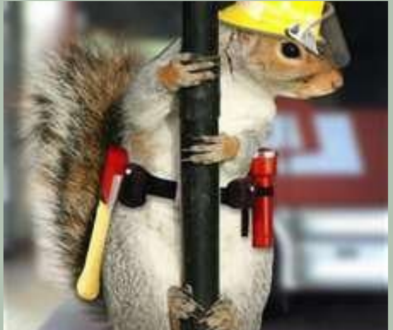
Slough Denizen Ready to Assist!

Although busy season may not be ideal for people, it is when it comes to weather! In the summer months, construction projects have to contend with daily afternoon thunderstorms, lightning, and hurricanes. The water levels are also higher which means access to certain areas may be limited or cause excess damage. In Southwest Florida, most construction takes place during the dry months to minimize impact to the environment and make it easier to perform the necessary work.