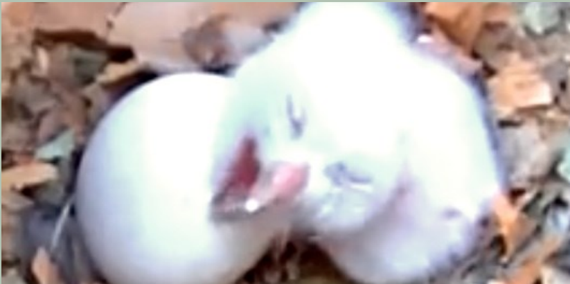
Barred Owl Hatchling

Did you know that birds of prey , like barred owls, are born covered in white or gray, fluffy down feathers? Many other bird species hatch featherless.