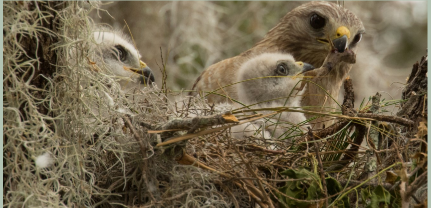
Red -Shouldered Hawk nesting at Nature Center at The Great Outdoors

Did you know that here in Florida, many birds of prey nest in the winter and nesting season lasts into the spring? Some pairs use the same nests year after year.