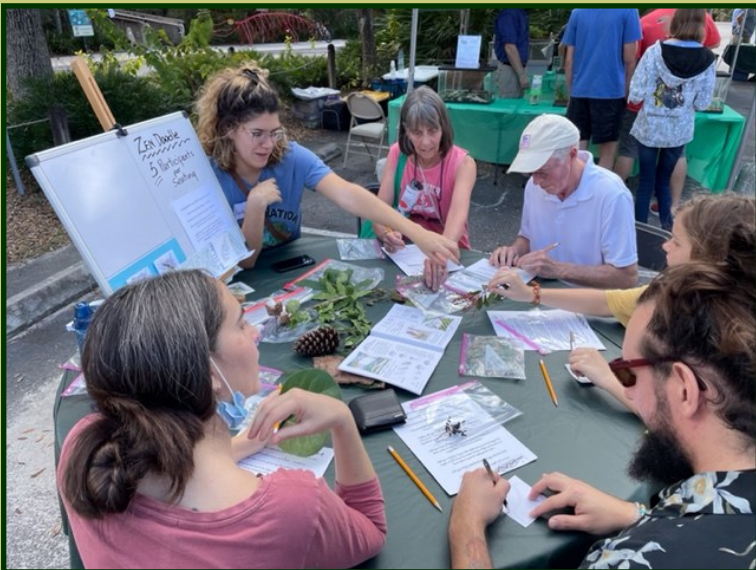
Slough Zen Doodle