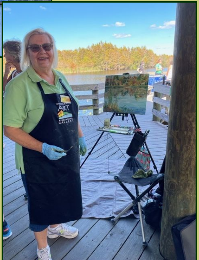
Artist at Gator Lake