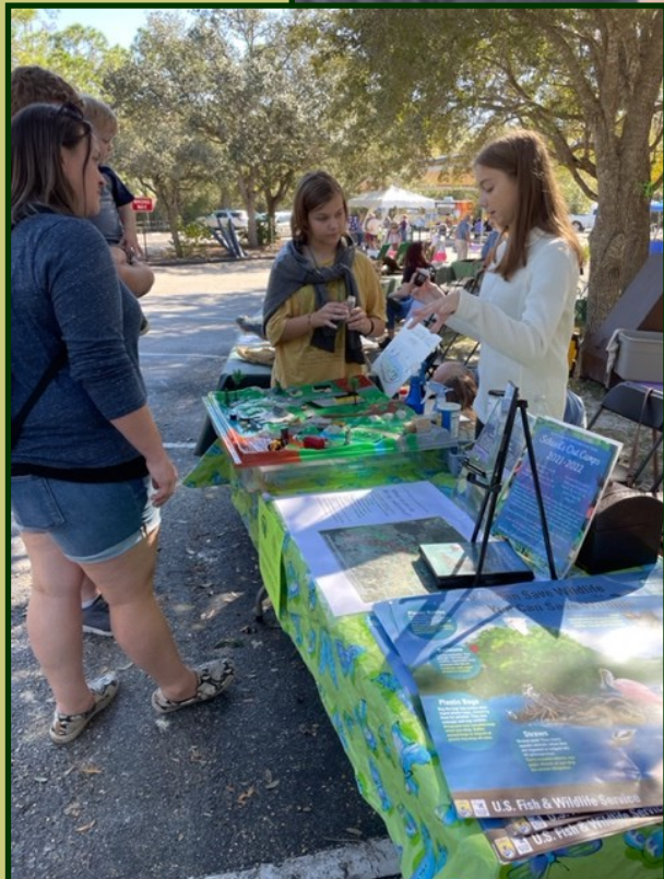
Lee County Schools Environmental Education