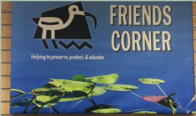
Friends Corner Sign

Did you know that Friends Corner has reopened?