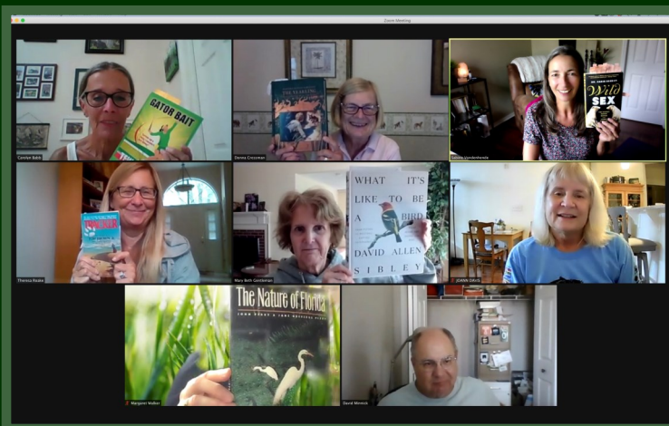
Screenshot of Inaugural Meeting

After registering, you will receive a confirmation email containing information about joining the meeting.