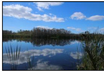
Third Place Plants Theresa Baldwin