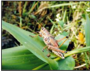
Second Place Youth Quinn Campbell