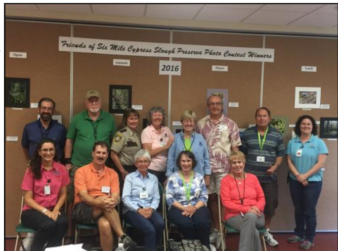
Safety on the Boardwalk module participants and instructors.

A desire to learn keeps us young at heart. Slough volunteers have such genuine enthusiasm for the Slough's inhabitants, whether they spot a sunning mud turtle or an undulating otter, that they can't help but share their excitement with our guests. We hope their experiences in the Interpretive Naturalist Training Program further empower them to instill a deep love of the Slough in each and every visitor.