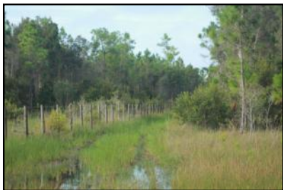
Six Mile Cypress Slough Preserve North

A referendum to continue Conservation 20/20 will be on the ballot this November. Currently, there are 42 preserves and over 25,000 acres acquired through the program. There is still much work to be done in mitigating the future impact of an ever-burgeoning human population. Voting for the program will not raise your taxes, and voting against it will not reduce your taxes. A yes vote in November will insure continued safe sources of drinking water, protection against storm water damage, vital wildlife habitat for threatened species, and a wide variety of passive recreational opportunities to Lee County's citizens.