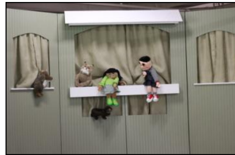
Puppet show by the campers