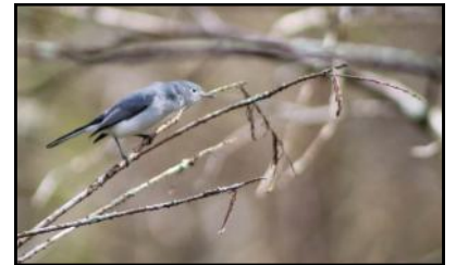
First Place Youth Kaitlyn Stucker