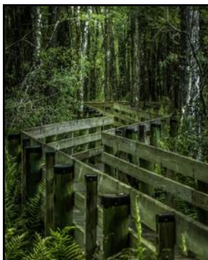
First Place Open Landon Snider