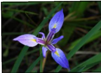
Second Place Plants Heidi Wise