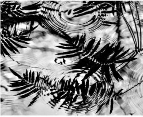
First Place Altered Deborah Wedeking