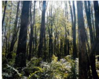
Third Place Youth Quinn Campbell