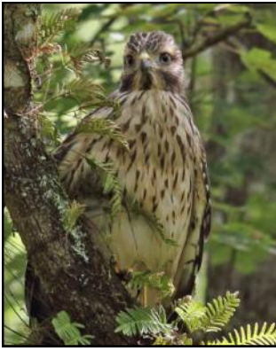
First Place Animals Chuck Pavlick