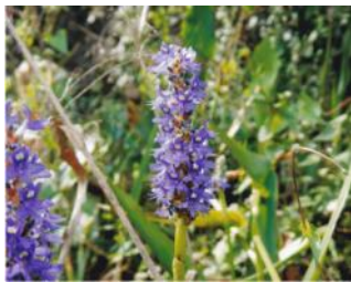
Honorable Mention Youth Quinn Campbell