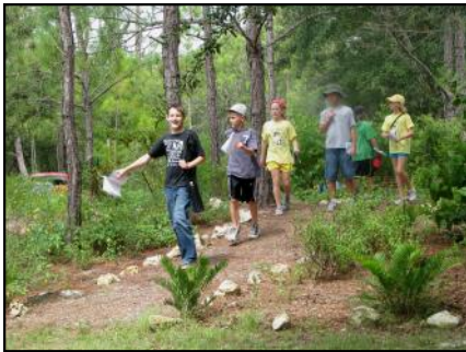
Scavenger hunt in the garden