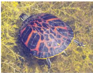
Honorable Mention Youth Shyla Rae Flint