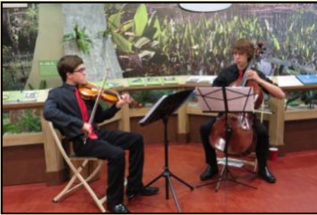
The Edison Strings