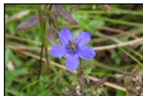
Wildflowers at CREW