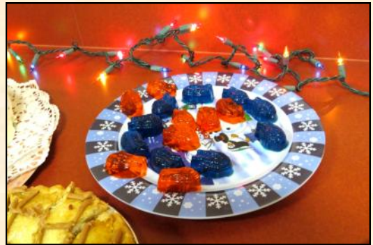
What's a potluck without Gator Jell-O Jigglers?