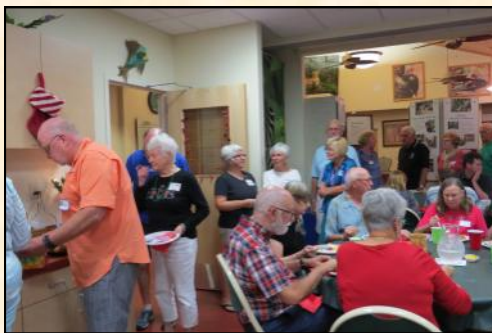
Lining up for the feast