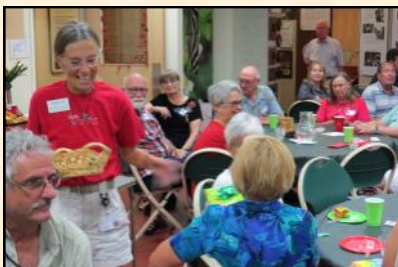
Potluck prizes always a treat