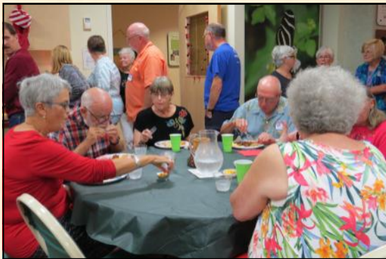
Friends enjoying friends