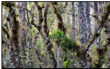
Mistletoe at Otter Pond

the roosts were often covered with bird droppings, the plant's name is derived from the Anglo Saxon words for “dung stick”, a reference to where the plant could be found.