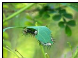
Swallowtail Butterfly Caterpillars