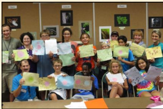
Proud paper makers