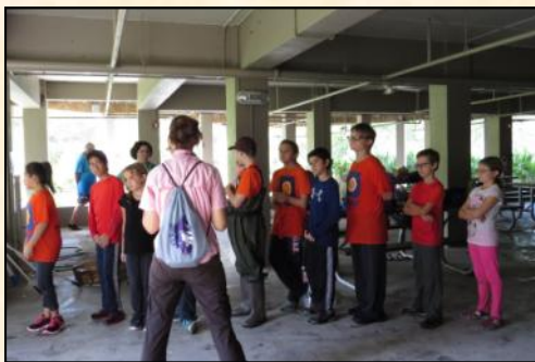
Into the wild