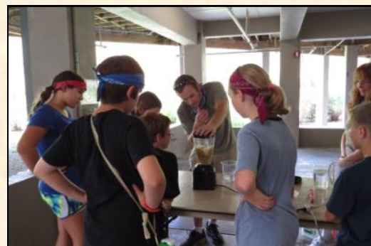
Who wants the first glass?