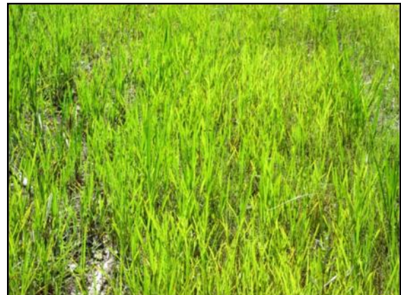
Wright's Nut Grass seedlings off Morgan Hill Road