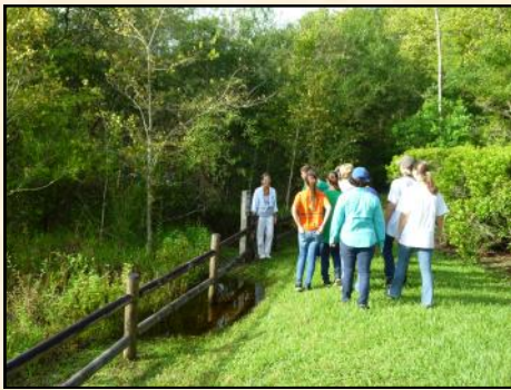
Get wet—you bet!