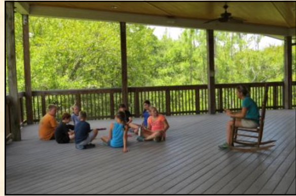
Quiet time on the deck