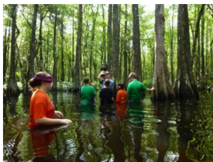
Blindfold drum stalk activity for campers in the Slough.