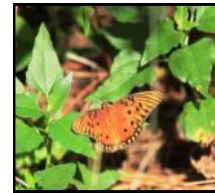
Gulf Fritillary Butterfly