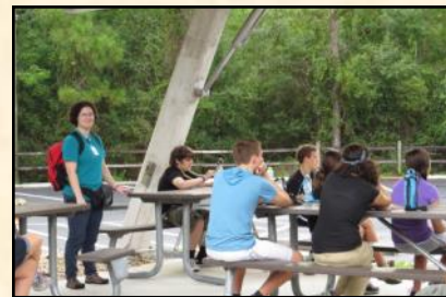
Enjoying outdoor learning