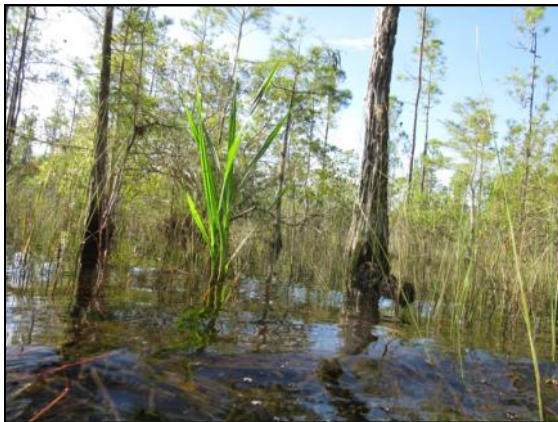
Wright's Nut Grass starting in the Slough north of Colonial Boulevard

This plant is designed to be hard to kill. It is an annual so you need to kill it before it seeds. It sprouts at the beginning of the wet season so you can't drive in to kill it without digging up the roads. You have about 90 days to kill it before it seeds. After that it dies so it isn't worth spraying. The seeds sit in the soil until the right wetness clues it to sprout. Too dry and it waits till next year. It can take over an area quickly under optimum conditions.