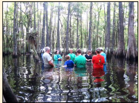
Contemplating the cathedral