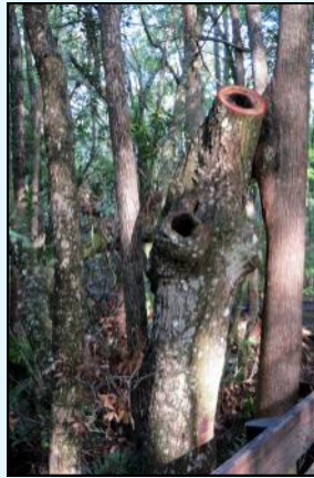
Saved snake home