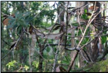
Snake skin behind snake home