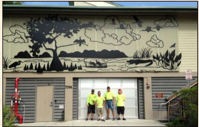
US Sign and Mill fabricated and installed the mural. The crew proudly stands before the completed project.