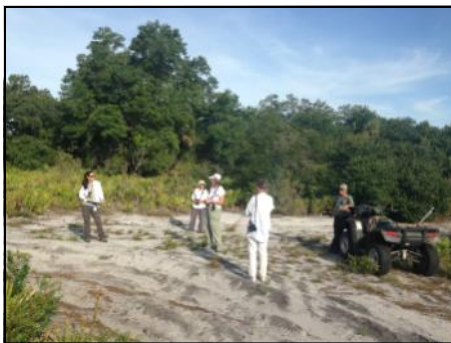
Volunteers await the birds.