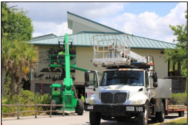
The first panel of the mural took the first of three days for installation. After it was firmly in the proper place the remaining panels were installed fairly quickly.