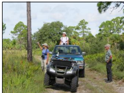
Scrub-jays are called with recorded sounds of the social birds.