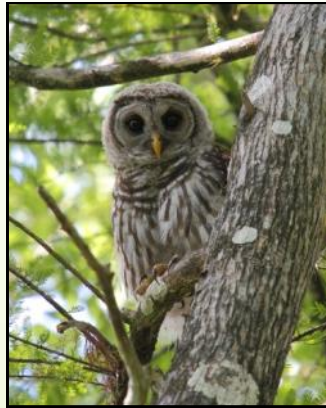
2011 First Place Animals, Charles Pavlick

The Friends of the Six Mile Cypress Slough Preserve fourth annual photo contest submittal begins November 1, 2012. Photographers may submit three photos until the end of January 2013, with prizes awarded at a reception at the Interpretive Center at 10:30 am on Saturday, February 16, 2013.