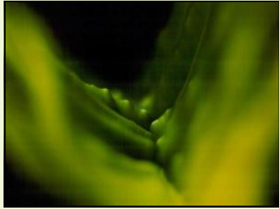
FIRST PLACE MADDIE MCWILLIAMS