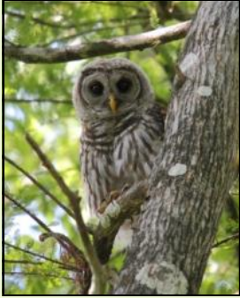
FIRST PLACE CHUCK PAVLICK