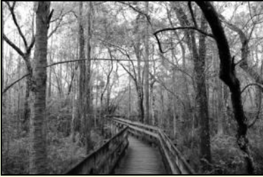
SECOND PLACE HANNA GRIMM