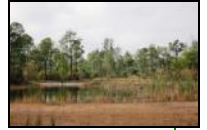
Pop Ash Preserve Friends Field Trip

Hi Friends—Another busy three months have flown by at the Slough. It's been non-stop at the Interpretive Center and on the boardwalk. All of our Gatherings with speakers were "SRO." We hope to