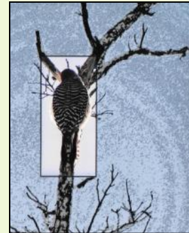
SECOND PLACE KRYSTLE DINICOLA