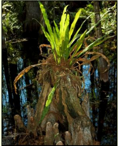
HONORABLE MENTION SUSAN SNYDER