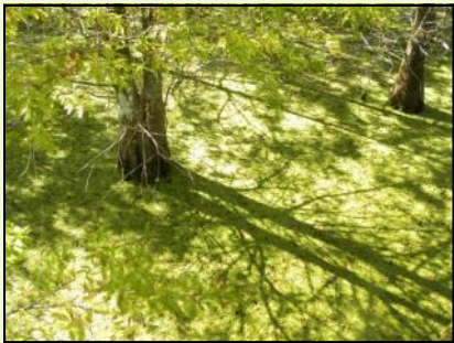
SECOND PLACE ROBIN BELL