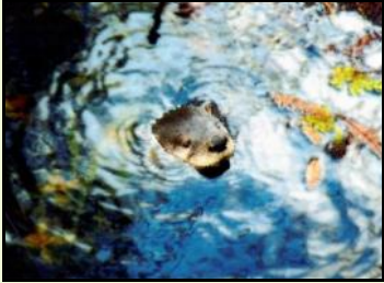
HONORABLE MENTION ANNA EPPLE