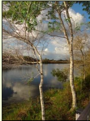
SECOND PLACE LINDA NORMOYLE