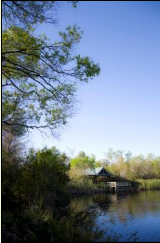
FIRST PLACE KEITH RIDGE