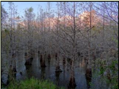
THIRD PLACE LINDA NORMOYLE