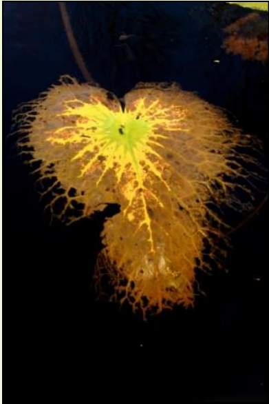
FIRST PLACE CHARLES O'CONNOR