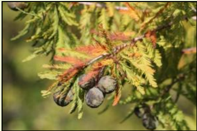
SECOND PLACE CAROLYN BABB