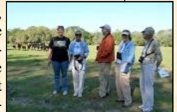
Happy field trippers at Celery Fields Audubon Preserve in Sarasota