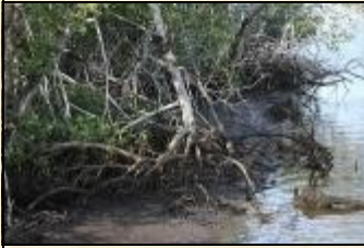
Rookery Bay National Estuarine Research Reserve in Naples

The Six Mile Cypress Slough Preserve Special Events Committee, which is basically me, has a full line-up for this season. Special Events mans (womans?) a Slough display at public events to attract new Slough visitors. Our year started in September with the Living MINDfully Festival , new this year. It was followed in November by the Charlotte Harbor Nature Festival . The Burrowing Owl Festival February 25th at the Rotary Park in Cape Coral from 10:00 am until 4:00 pm and the CREW Wildflower Festival March 31 from 8:00 am until 2:00 pm, round out the schedule for this year. In all, our display is visited by hundreds at these events.