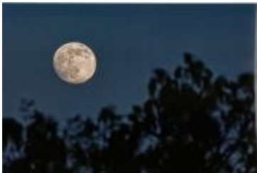
2010 Photo Contest Winner by Vincent Abbatiello