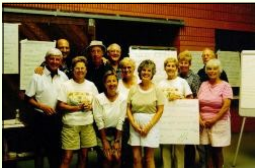
2001—The start of the Friends Organization

Friends of Six Mile Cypress Slough Preserve is a not-for-profit advocacy and support organization committed to preserving, protecting and promoting Six Mile Cypress Slough Preserve for future generations through education and community partnerships, working together with Lee County and South Florida Water Management District. The Six Mile Cypress Slough Preserve is a critical wetland system having positive value in inspiring and educating its visitors about wetlands and their roles in preserving the environment and local quality of life. Friends' vision is to maintain the Preserve's positive community influence in perpetuity.