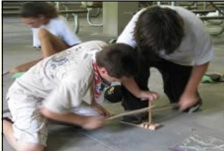
SUMMER CAMPERS MAKE FIRE!

Friends of Six Mile Cypress Slough Preserve is a not-for-profit advocacy and support organization committed to preserving, protecting and promoting Six Mile Cypress Slough Preserve for future generations through education and community partnerships, working together with Lee County and South Florida Water Management District. The Six Mile Cypress Slough Preserve is a critical wetland system having positive value in inspiring and educating its visitors about wetlands and their roles in preserving the environment and local quality of life. Friends' vision is to maintain the Preserve's positive community influence in perpetuity.