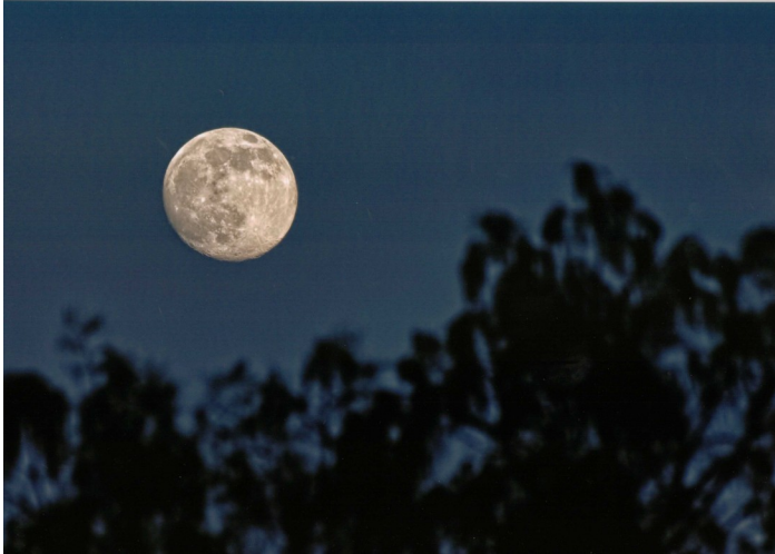
OPEN CATEGORY VINCENT ABBATIELLO