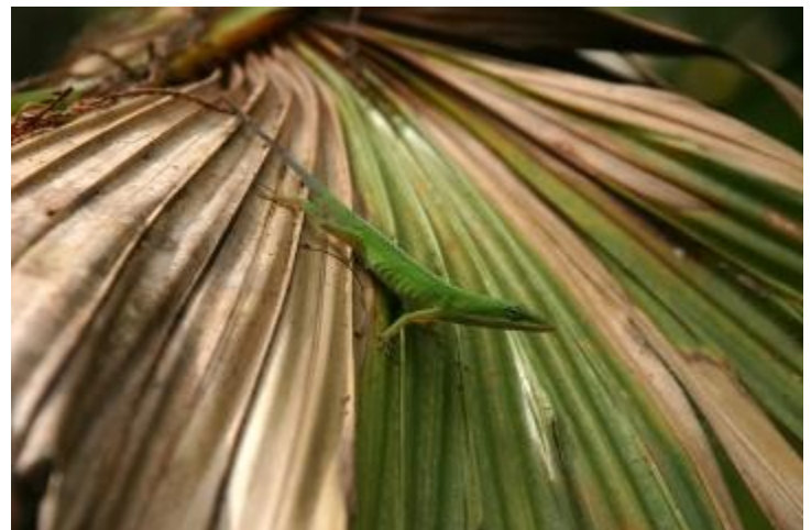
STAFF CATEGORY CHARLES O'CONNOR