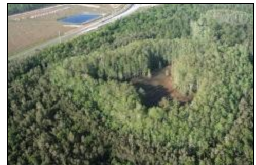
Aerial view of the new Slough property north of SR 82