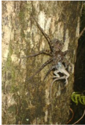
STAFF CATEGORY Second Place Charles O'Connor