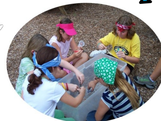
Campers playing a game called Bird Beaks and Feet.