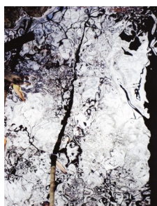
Some of last years winners

Plans are being made for the second Friends of Six Mile Cypress Slough Preserve Photography Contest. Photographs will be accepted between October 1 and December 31, 2010. Judging will take place in January with the announcement of winners and awards sometime in February 2010. Rules and entry information will be in the September issue of Connections and on line at www.sloughpreserve.org .