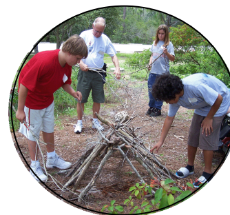
Campers making a wilderness shelter out of natural materials.