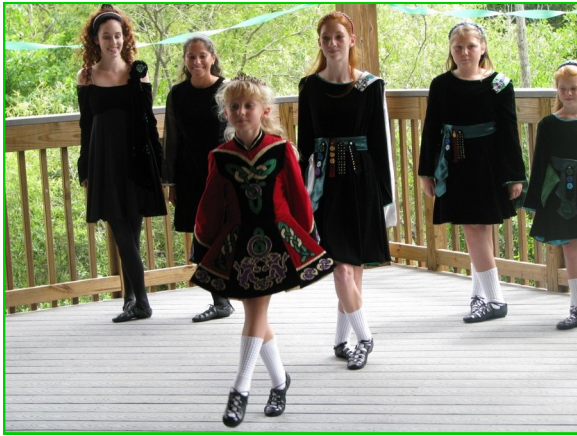
Kellyn Celtic Arts Students entertained Friends members and guests at the March 17, 2009 "Green" celebration at the Interpretive Center at the Slough. Friends members celebrated by wearing green shirts.