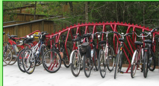
The alligator bicycle rack was full of visitors' bicycles ridden to the Grand Opening ceremony.

The long awaited happened on April 12, 2008 with a Grand Opening Celebration and a "Green" Ribbon cutting by all of the people who were responsible for this historic occasion!