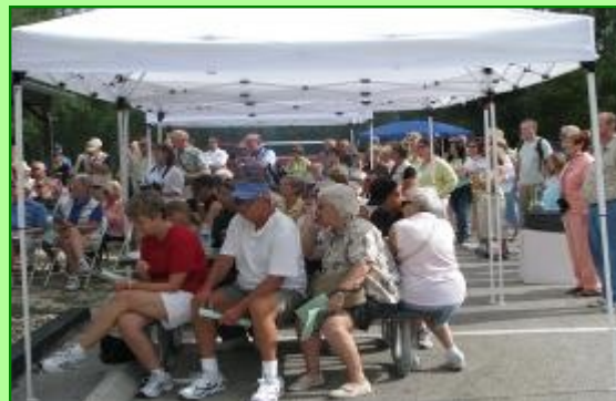
The crowd anticipates the long awaited welcome and congratulatory speeches by invited guests.