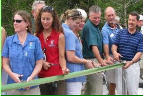
The anticipated ribbon cutting by excited staff, volunteers and dignitaries..